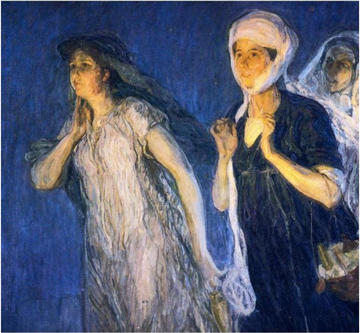
Detail from "The Three Marys" by Henry Ossawa Tanner