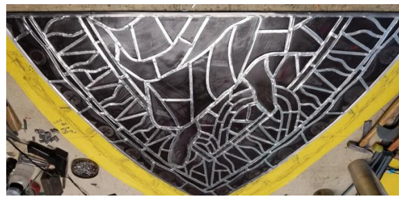
Lower center panel

He is expecting to finish the work on the window itself by the end of August, with a planned re-installation mid-September. Wonderful news for sure!