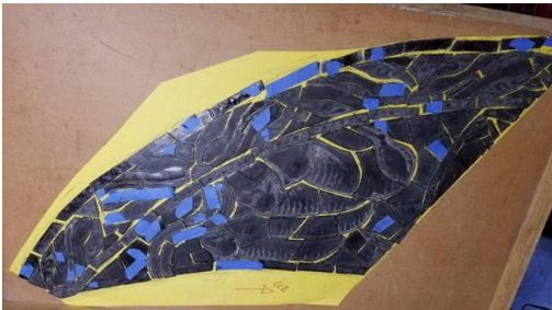
The worst affected panel, the blue tape corresponds to a broken piece of glass

Once he got the window further disassembled in his studio, there was yet more cracked glass than he had expected to see. In addition, the glass in some areas was not flat, but convex; the paint (glazing) in some areas was pitted and not well-fused to the glass. He has repaired the glass. The glass has been cleaned, the pitting makes that more difficult, along with needing to take extra care not to remove the paint.