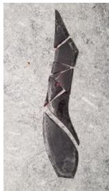
Broken glass example (one of the worst)