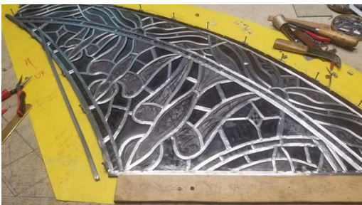
Upper right panel

This past week, he updated us regarding his progress. Four of the 7 window panels have been renovated. He is re-enforcing the window to provide more support for its weight. There will be a layer of tin solder on all lead surfaces not just at the lead joints (which is the usual). This adds weight, but also adds strength. In addition to this, on the exterior face, he will place vertical brass strong backs that will complement the existing interior horizontal round reinforcing bars; essentially sandwiching the window panel between a mesh-like superstructure. Besides this new structure, the window, once reinstalled, will be vented (it wasn't before) which will lessen temperature stress on the window. Both of these maneuvers should help maintain the window for a long time.