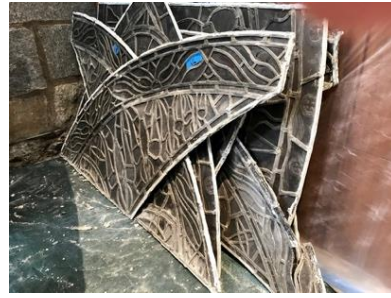
All the panels removed, waiting to be taken out of the church.

Once he got the window further disassembled in his studio, there was yet more cracked glass than he had expected to see. In addition, the glass in some areas was not flat, but convex; the paint (glazing) in some areas was pitted and not well-fused to the glass. He has repaired the glass. The glass has been cleaned, the pitting makes that more difficult, along with needing to take extra care not to remove the paint.